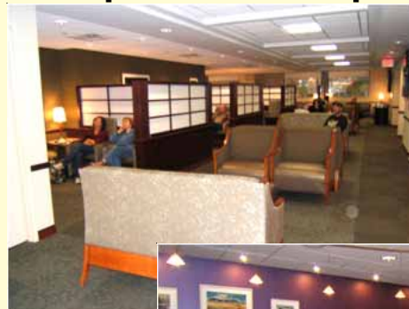
Proposed Waiting/Respice Area