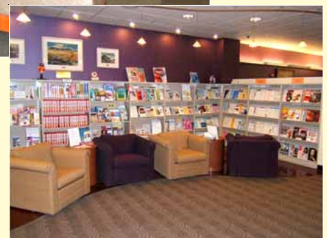
Proposed Medical Library