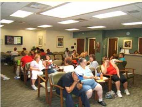
Existing Waiting/Respice Area