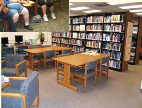
Existing Medical Library